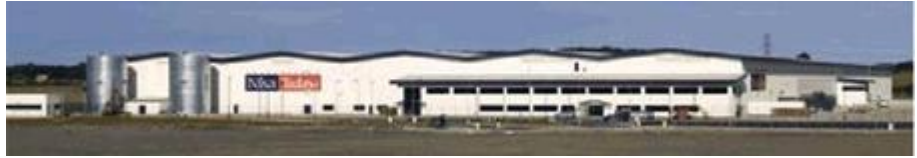
NISA Distribution Centre, Scunthorpe

Clear Image was awarded a contract to supply and fit CCTV and Access Control to one of the largest picking warehouses in Europe. The company runs 3 shifts per day and wanted to allocate lockers to employees. The simple solution would have been to give each employee a locker, but between Borer and Clear Image, a better solution was created.